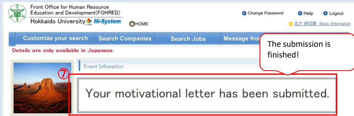
Figure 5: Event Information screen

(7) Make sure that “the motivational letter has been submitted.” The submission is now finished.